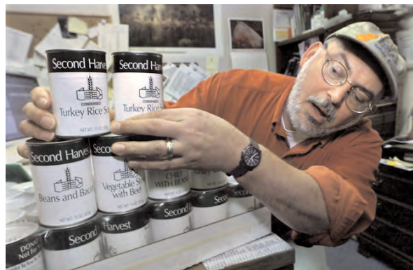
In Nashville during 2000, resources available for emergency food aid declined slightly, but requests for assistance went up by 25 percent. More than two-thirds of those seeking food are employed. Second Harvest Food Bank is one of several local nonprofit food-assistance programs in the city.

Moreover, there were disturbing signs that more and more people were falling through the cracks of Nashville's social structures. Whether because of welfare reform or not (and according to advocates, only about 40 percent of the people compelled to leave the welfare rolls were employed), Nashville in 2000 was gaining the dubious distinction of being a