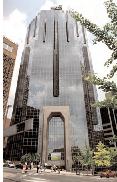
One by one, the headquarters buildings of Nashville financial institutions changed hands around the turn of the century. Two of the oldest—the Life and Casualty and National Life insurance companies—were the first to go, and others soon followed: First American (left) became the AmSouth Bank Building, The SunTrust Center (center) traced back to Third National Bank and First Union Tower (right), which had roots in the Nashville Trust Company, now is known as Firstar Tower.

belched a cloud of phosphine gas over the area near 4600 Centennial Blvd., and the Cumberland River. The flammable gas, which packs a garliclike stench, can be lethal in high doses, and dramatic TV news reports temporarily scare the hell out of viewers. But the factory blaze is extinguished by 10:40 p.m., and residents are home by 11:15, breathing easier.