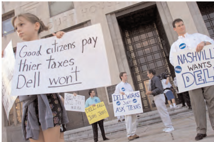
Pickets worked both sides of the issue when Mayor Bredesen brought the "Dell deal" before the Metro Council, which endorsed it after heated debate. Dell started construction immediately.