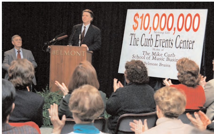
As a record company executive in Nashville, former California Lt. Gov. Mike Curb found the community to his liking. He branched out to become an important Republican Party fund-raiser and a major benefactor of Baptist-affiliated Belmont University.