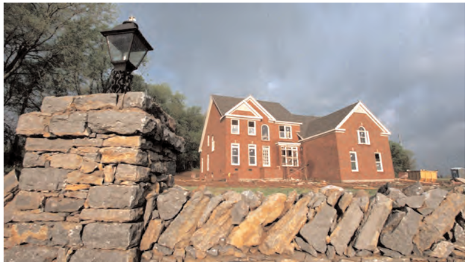
The rapid expansion of industry in the Nashville metropolitan area spurred high-income population growth throughout the 1990s, and that, in turn, caused a housing boom, particularly in Williamson County to the south. Scores of rambling mansions and showplaces were springing up like mushrooms in the rolling hills and farmlands, so many that a couple of generic names became attached to them: "McMansions" and "Brentwood houses."