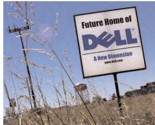
When industry leader Dell Computer came looking for plant sites in 1999, Metro outbid all suitors by giving up free land next to the airport and exclusion from most taxes.

The local economy had benefited from its past misfortunes. The occasional woes of the past two decades, such as the real estate-driven recession of the late 1980s, tended to strengthen the resolve of community leaders to insulate the city from such shocks in the future. The mid-to-late 1990s were boom years for commercial property development in town, but only because growth in the overall economy was creating new demand for office and warehouse space. This was not the speculative, debt-driven boom of the 1980s, a hot streak that ended with bad loans sending First American's stock to low single digits, Metropolitan Federal Savings & Loan being taken over by federal regulators, and the Federal Deposit Insurance Corporation citing Nashville as the nation's second-worst commercial real estate market. All parties involved had been humbled by the comedown. Developers were now more conservative in their plans, and so were local bankers.