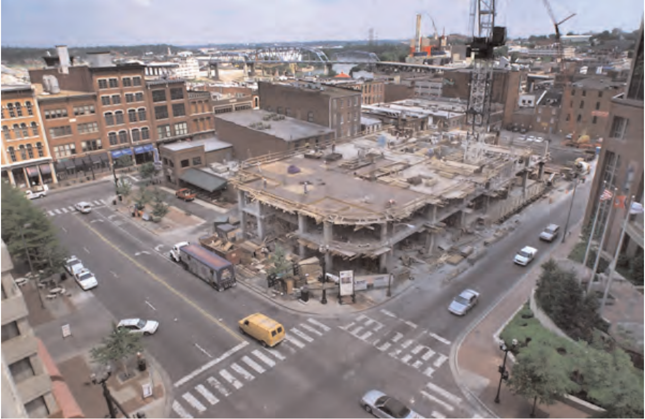
Commercial development was booming not only in the vicinity of suburban shopping malls; there was evidence of it in downtown Nashville too: the Magnetek Building at Third and Commerce.