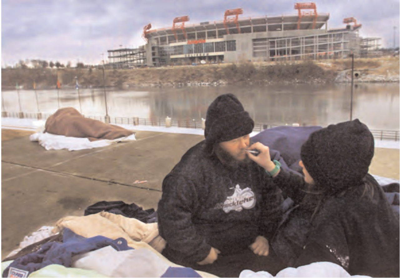
More than a thousand people live on the streets of Nashville, sleeping in parks and under bridges, even in winter. Contrary to common belief, about half of the homeless are employed but don't earn enough to afford housing.

national leader in one particular measure of poverty: the so-called “working poor.” The city figured prominently in a U.S. Conference of Mayors’ “Status Report on Hunger and Homelessness,” covering a twelve-month period in 1999-2000. The report found that 50 percent of Nashville’s homeless, and 70 percent of those seeking emergency food assistance, were employed. The latter percentage was the highest in the country, and more than twice the national average. Local resources available for food aid during the period actually decreased, while requests for emergency food assistance rose 25 percent—the highest rate of the 25 cities surveyed.