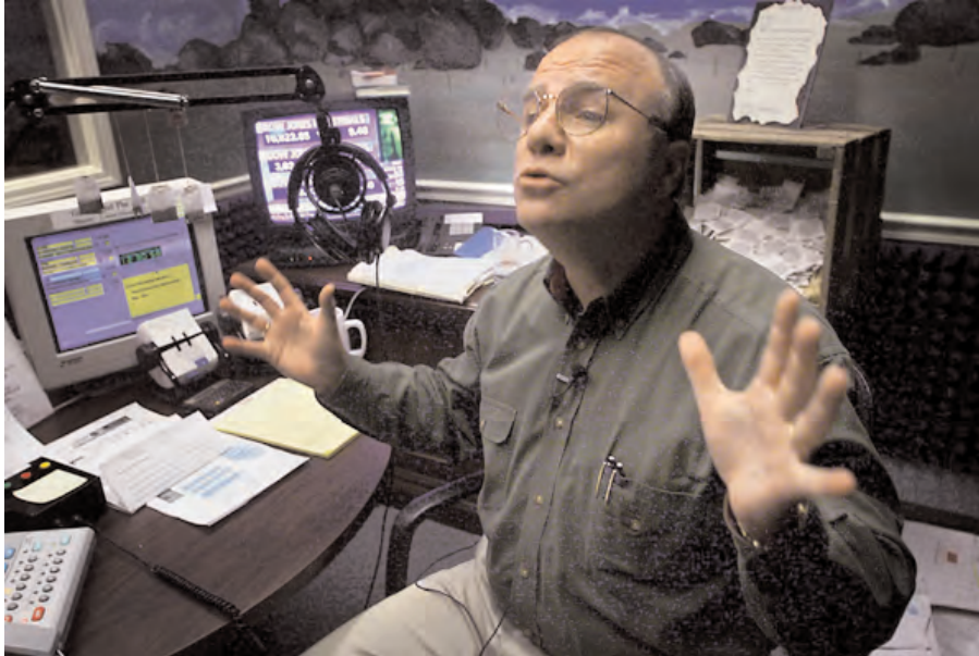
Radio talk-show host Dave Ramsey found a national audience for his “gospel of fiscal responsibility,” which he syndicates from a Nashville station. Ramsey, a Christian conservative, offers free tax advice and financial planning strategies on the air. He also has a book of money talk on the market.

percent—that it registered in the press as “token good intentions,” and nothing more came of it.