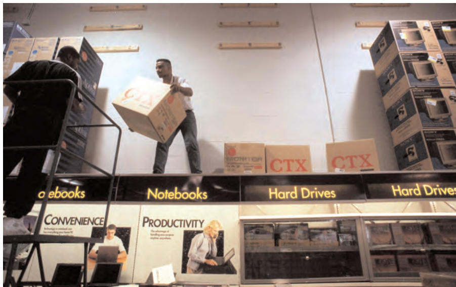
In the topsy-turvy corporate world of mergers, acquisitions and globalization, giant chain stores like Best Buy (above) dominated some fields, driving smaller retailers out of the field.