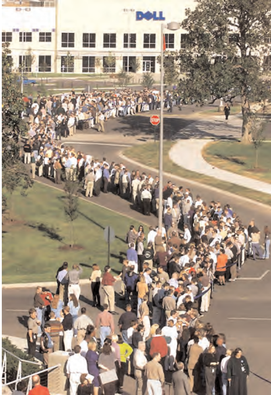
Within a year, in September 2000, Dell's assembly plant was up and running. The computer giant's 1,800 new employees assembled outside the new facility for opening ceremonies. Another 1,000 were already at work in rented warehouse space a few miles away, across the Wilson County line. In addition to tax breaks and free land, Dell would also receive from Metro a $500 annual fee—in effect, a bonus—for every person on its Davidson County payroll.

stations to the east—Donelson, Hermitage and Mt. Juliet—free rides were taken by about 2,400 riders. This route, extending to Lebanon, is slated for regular service by 2002, with other routes to Gallatin, Murfreesboro, Franklin and Kingston Springs to follow—if funding becomes available.